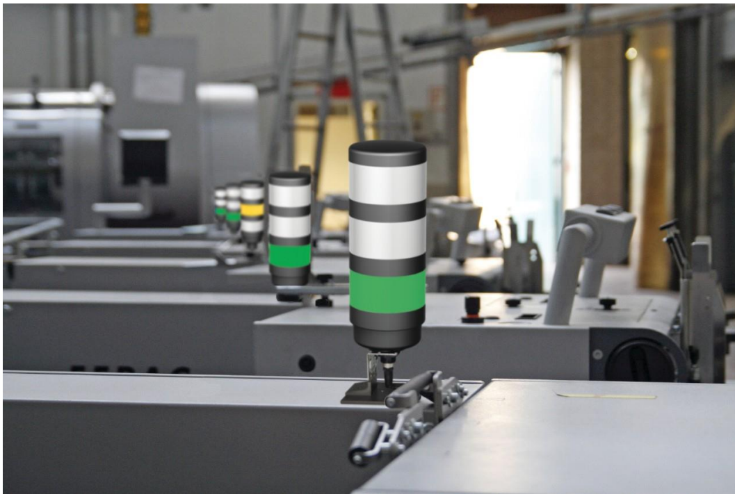
Wireless tower lights allow users to track trends in machine run time and cycle time

With a wireless system, users can easily monitor machines remotely in a central point to log information. For example, using a tower light with a wireless radio base offers not only local indication of machine status but can also provide remote status of each light module. By logging results from machine status indicators like tower lights, users can track trends in individual machine up time and cycle counts, giving operators machine status updates when and where it is needed. Capturing machine status helps users identify causes of production loss. This system provides the information necessary to identify and drive efficiency improvements based on data that was previously unavailable.